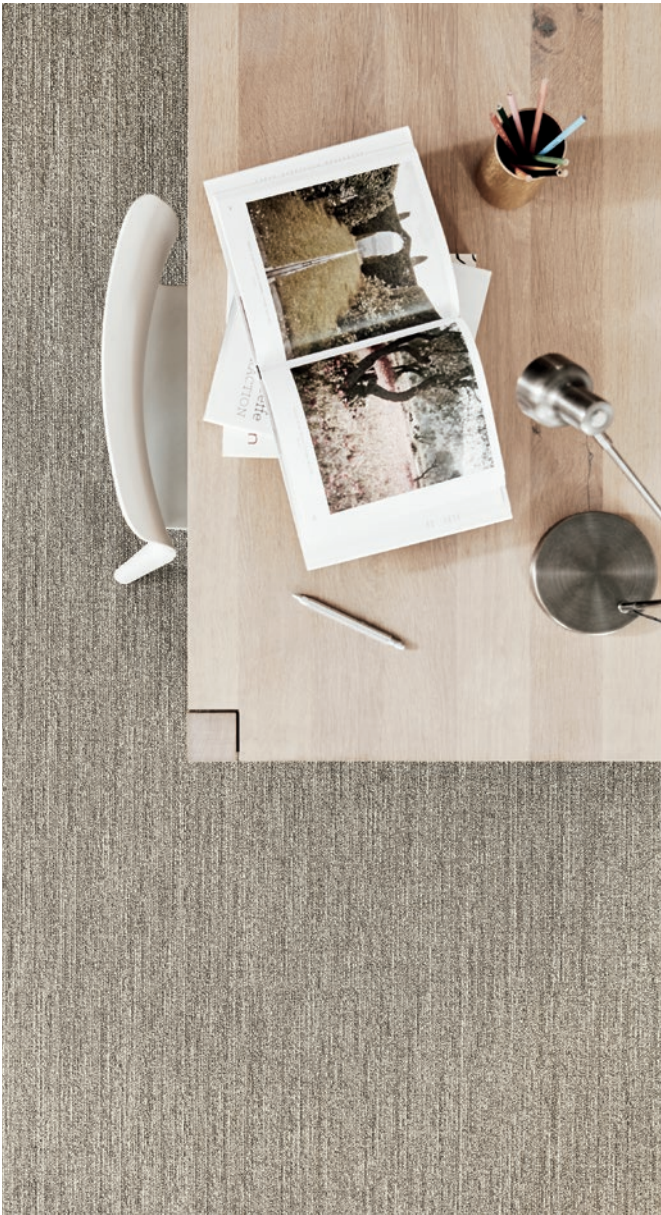
CLEARING (5T381) IN SAND (71111) | INSTALLED ASHLAR

Shifting Fields is designed so that different patterns, styles and sizes will fit different zones. It allows for coordination of the 18x36 and 9x36 tile sizes to be installed side by side. Making space for shifting transitions while improving zoning and spatial definition.