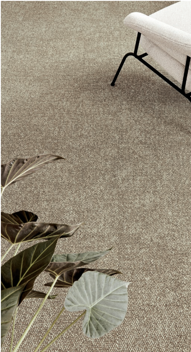
VISTA (5T380) IN SAND (71111) | INSTALLED ASHLAR