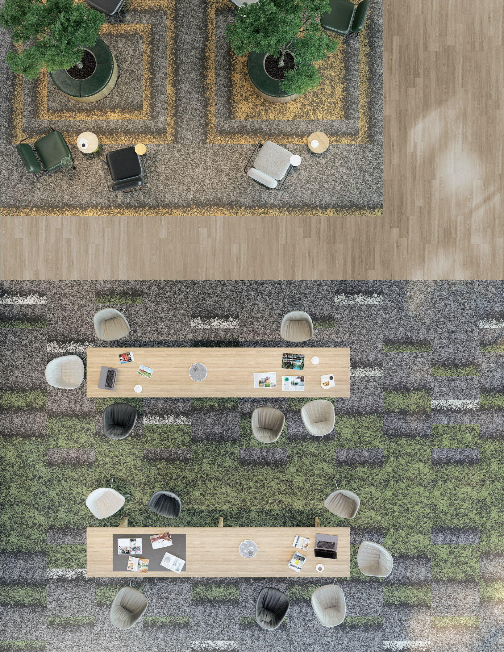
PLAINS (5T374) IN MEADOW (71375) AND LANDING (5T373) IN DISTANT (71505) AND LANDING EDGE (5T375) IN DISTANT BIRCH (71500) + DISTANT MEADOW (71375) | INSTALLED MONOLITHIC, INSTALLED ALIGNING THE EDGES ON THE FACE OF CARPET AND PLAINS (5T374) IN EARTH (71225) AND LANDING (5T373) IN OPULENT (71555)AND LANDING EDGE (5T375) OPULENT EARTH (71225) INSTALLED ALIGNING THE EDGES ON THE FACE OF CARPET AND TERRAIN II (0454V) IN ECHO (00775) | INSTALLED STAGGER

The borders between open and private spaces are clear. This biophilic flooring collection is designed for the ultimate in installation flexibility. And suggests a spatial play via patterns, textures and colors that point the way as they define space.