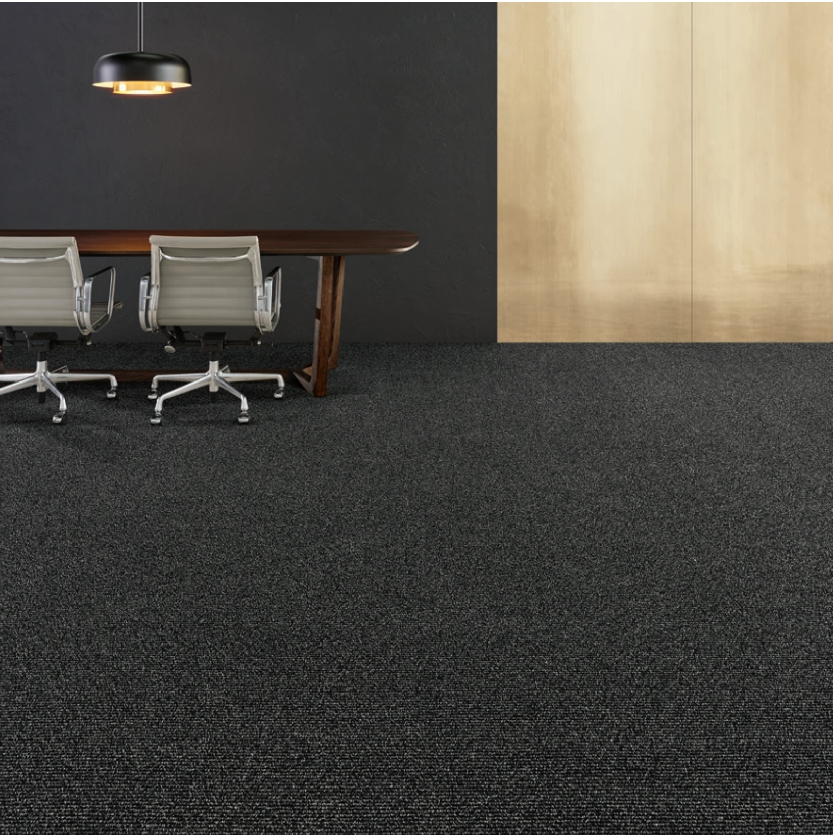
base metal 5A219 in onyx silver 18505