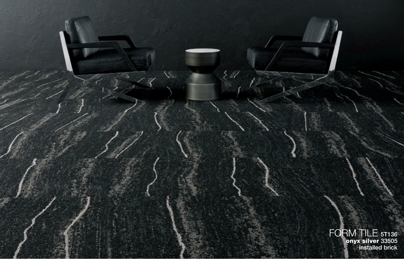
FORM TILE 5T136 onyx silver 33505 installed brick