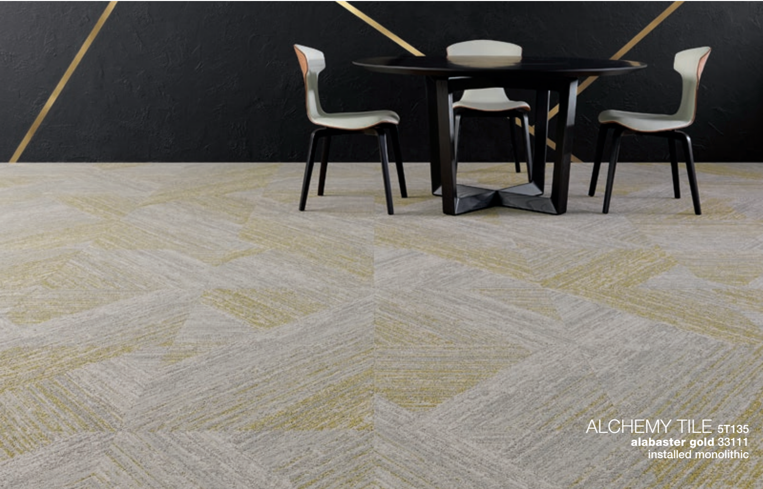
ALCHEMY TILE 5T135 alabaster gold 33111 installed monolithic

Visit shawcontractgroup.com or contact your local Shaw Contract Group account manager for more information on Noble Materials carpet tile.