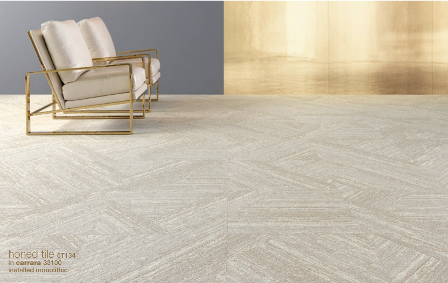
honed tile 5T134 in carrara 33100 installed monolithic