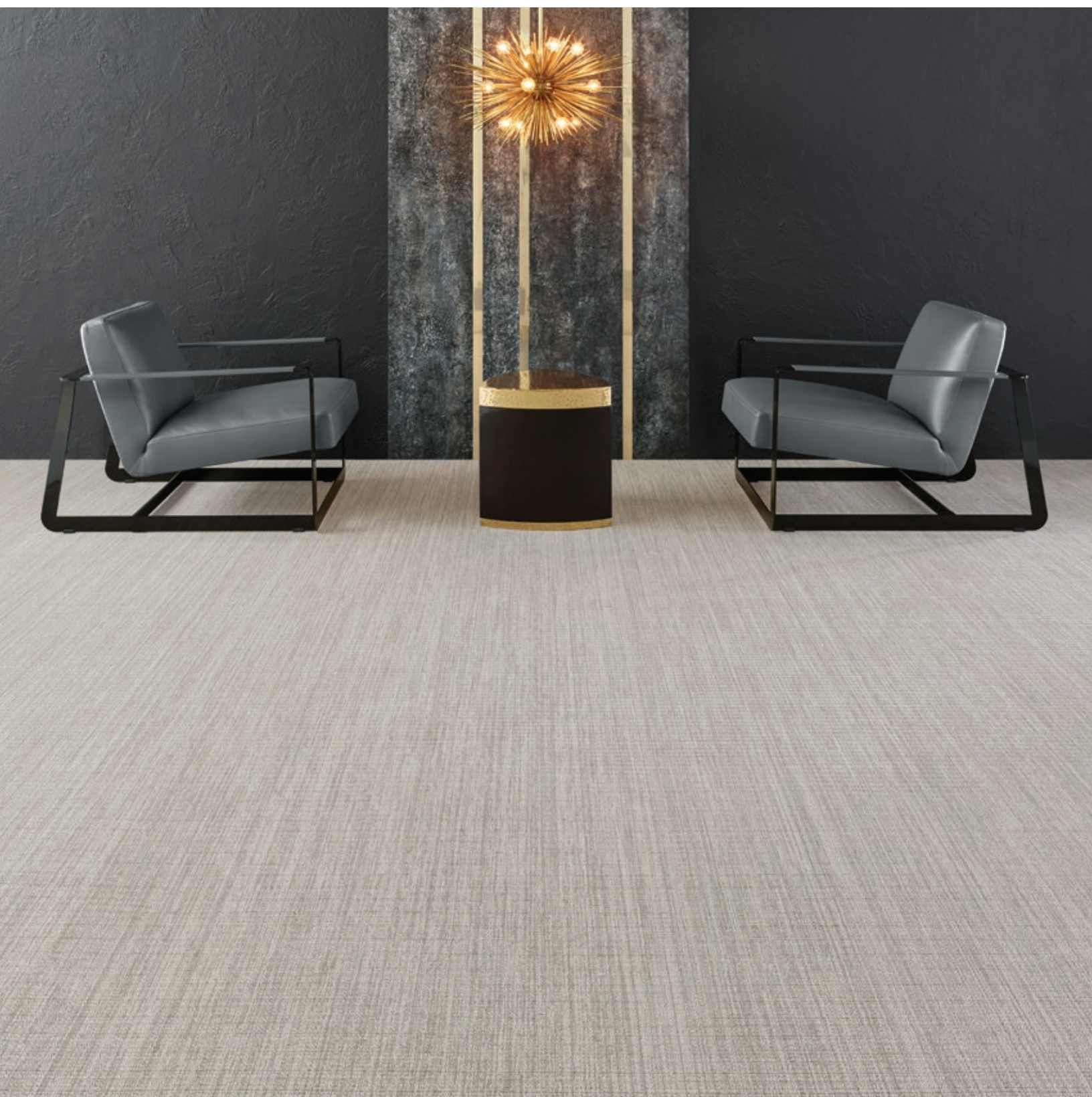
monolith 5A218 in alabaster 18111