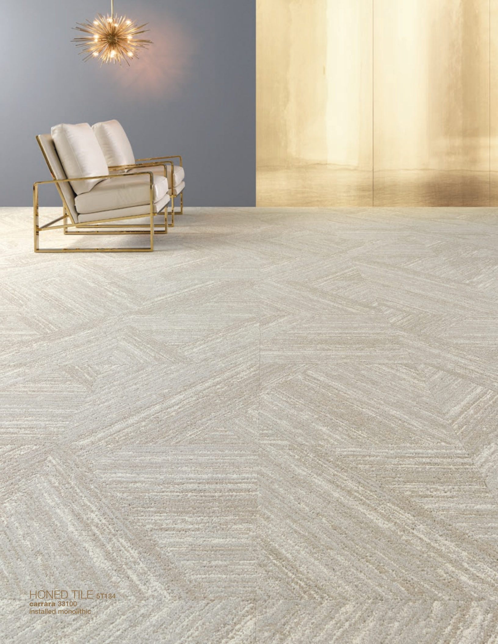
HONED TILE 5T134 carrara 33100 installed monolithic