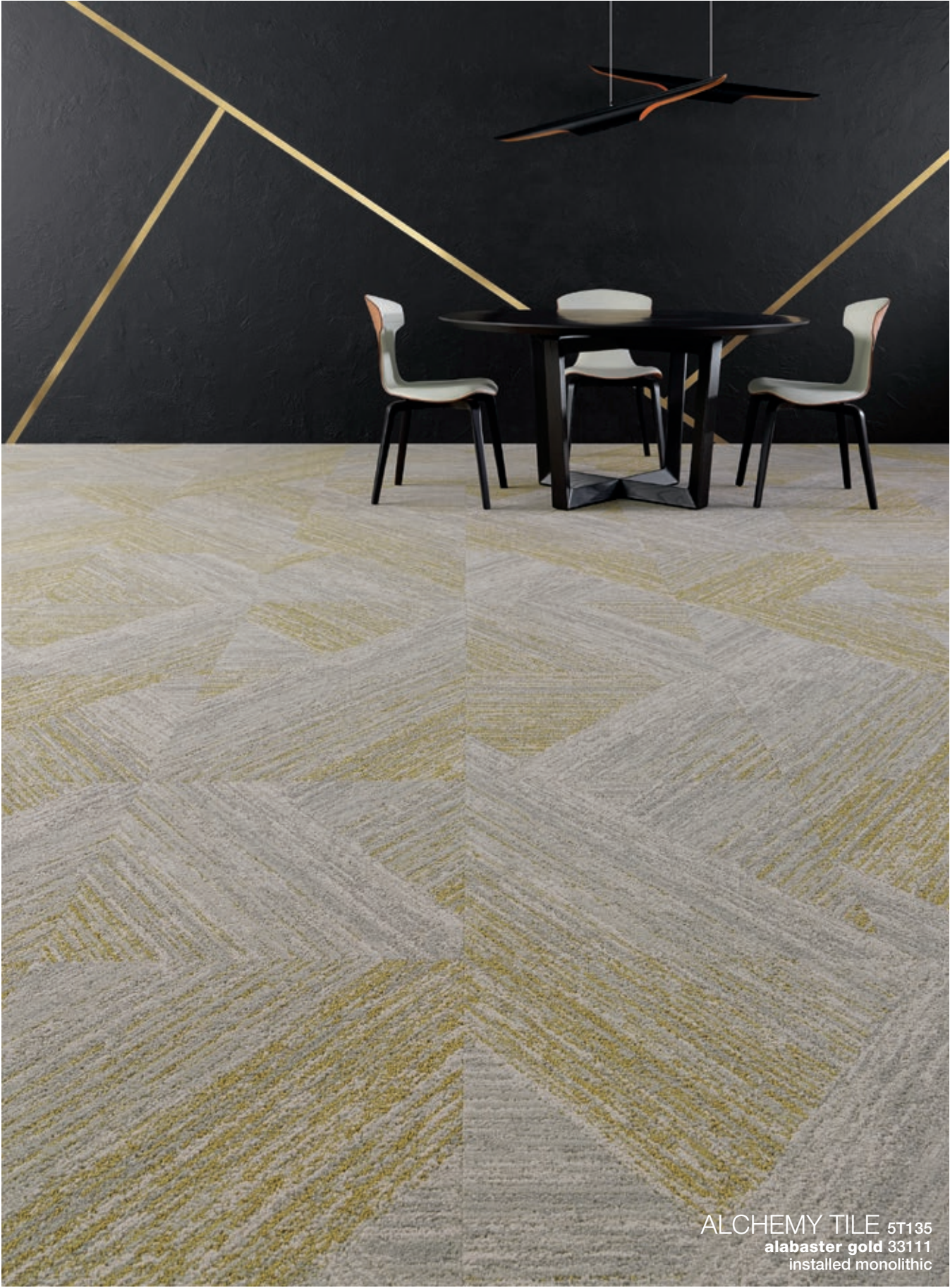
ALCHEMY TILE 5T135 alabaster gold 33111 installed monolithic