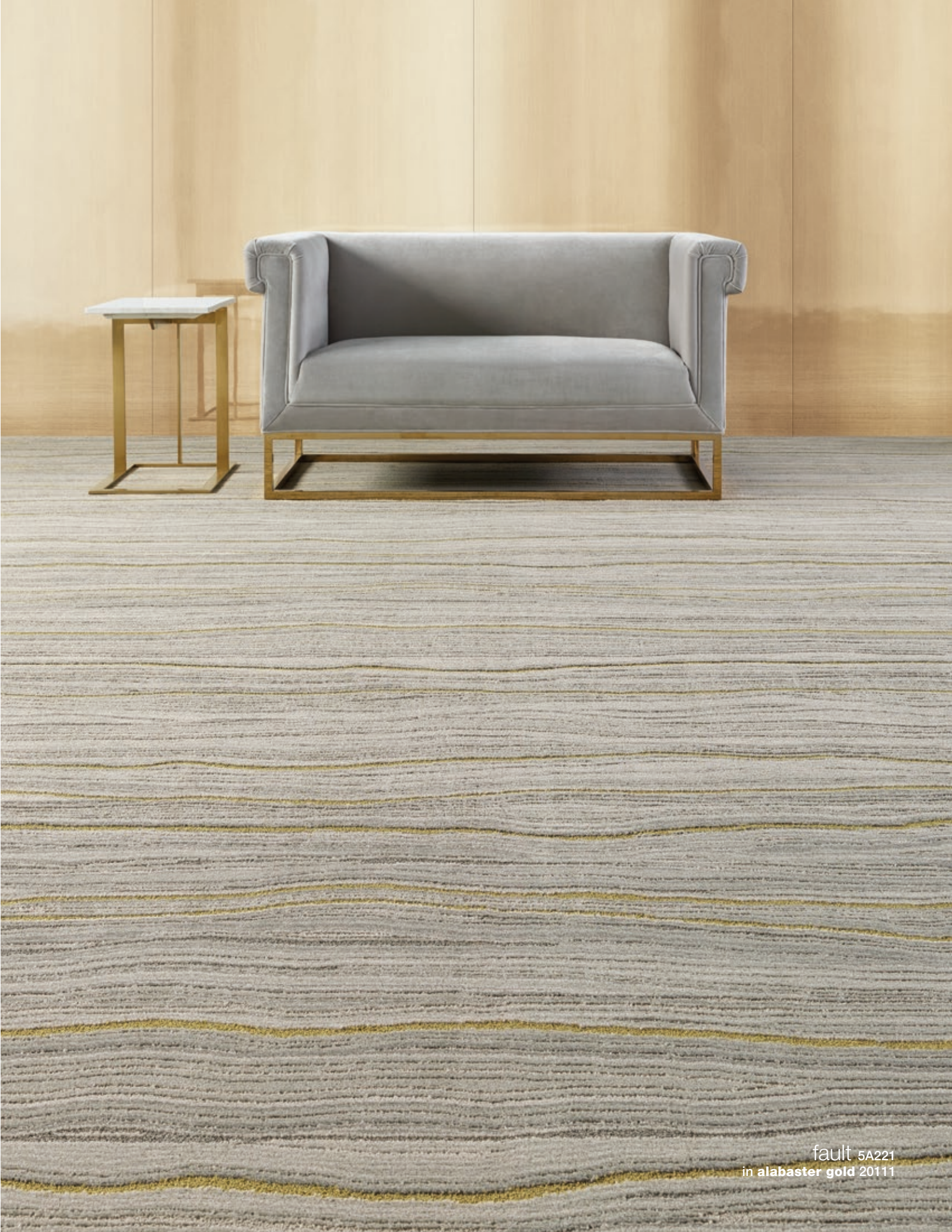
fault 5A221 in alabaster gold 20111