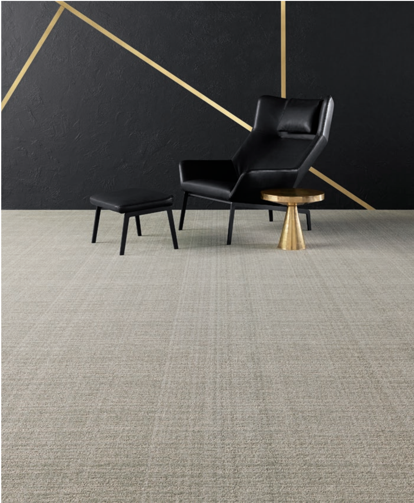
strata 5A220 in alabaster 20111