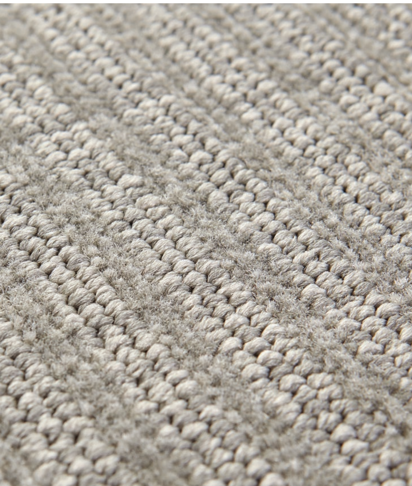
monolith 5A218 in alabaster 18111