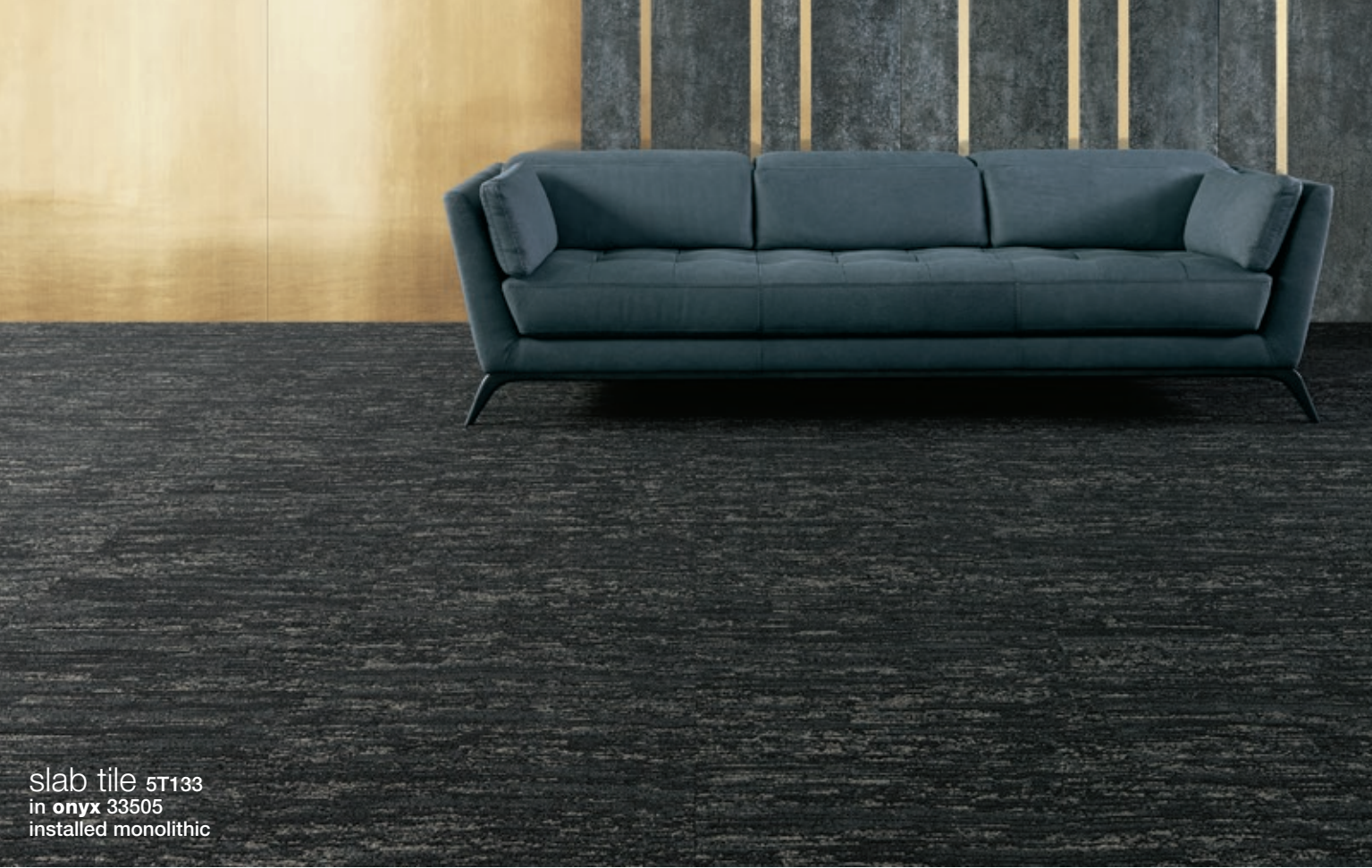
slab tile 5T133 in onyx 33505 installed monolithic

Visit shawcontractgroup.com or contact your local Shaw Contract Group account manager for more information on Noble Materials carpet tile.