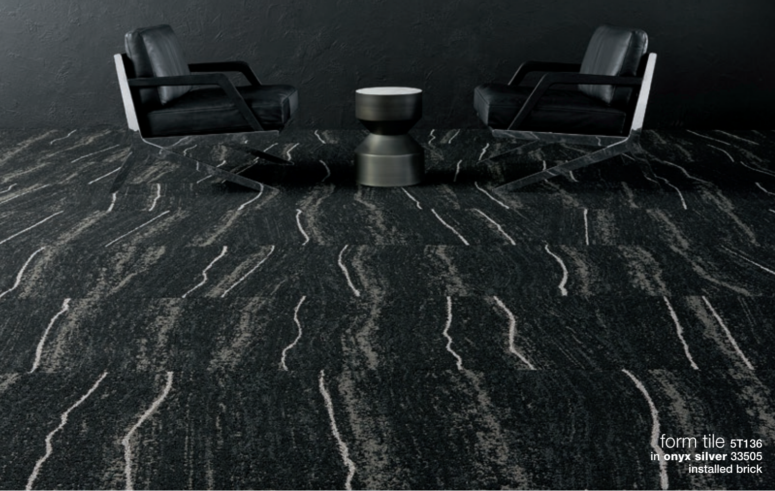
form tile 5T136 in onyx silver 33505 installed brick