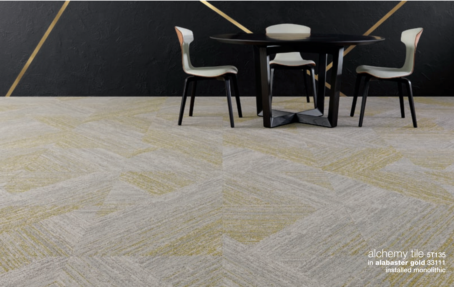
alchemy tile 5T135 in alabaster gold 33111 installed monolithic

Visit shawcontractgroup.com or contact your local Shaw Contract Group account manager for more information on Noble Materials carpet tile.