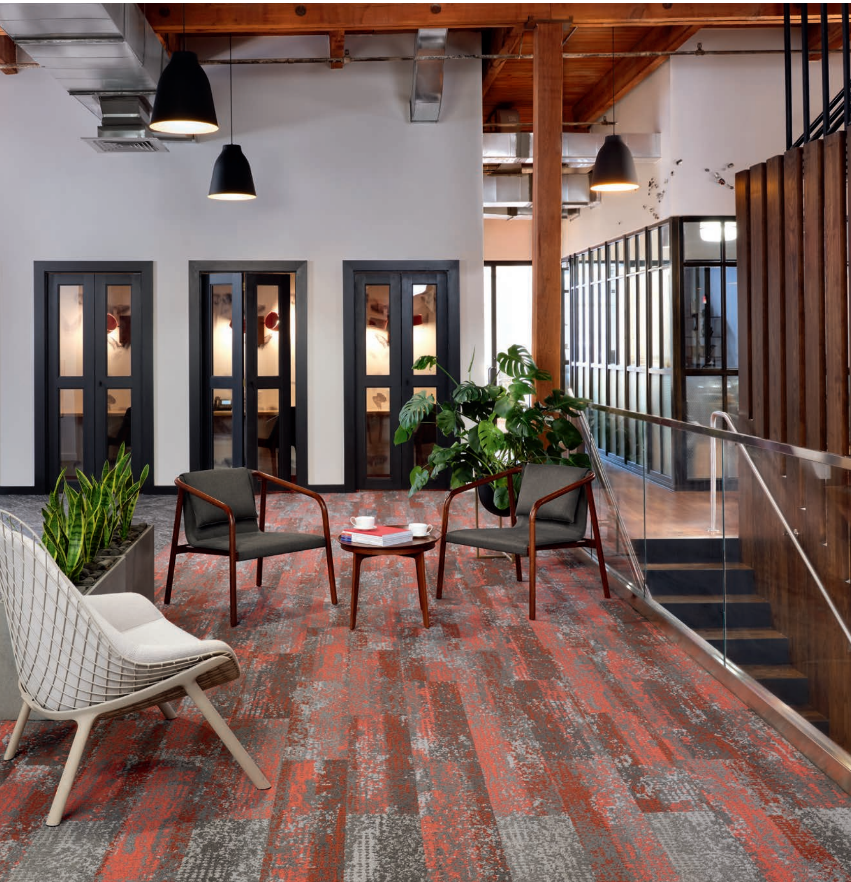
CORRIDOR: BOUNDLESS (5T314) IN COLOR WILD (05557) | INSTALLED HERRINGBONE SEATING AREA: RESPOND COLOR (5T310) IN COLOR FRAGILE CORAL (05865) | INSTALLED ASHLAR